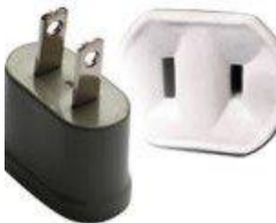
Type A: This socket has no alternative plugs

Type A and B plugs are used in Tokyo (JPN).