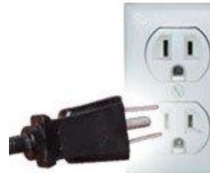
Type B: This socket also works with plug A