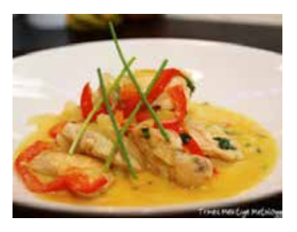
Sunday 30th of July Lunch

Chicken pot in curry with apples ginger and coconut milk, served with potatoes.