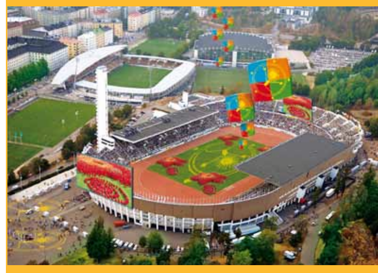
Olympic Stadium in the front with Sonera Stadium behind it.

The multifunction hall is used for a wide variety of training purposes and for competitions in basketball, volleyball, fencing, boxing and different disciplines of gymnastics. It is located by the main street of Helsinki, Mannerheimintie, and thus can be easily reached with public transportation. During the World Gymnaestrada this venue is used for different kinds of gymnastics activities.